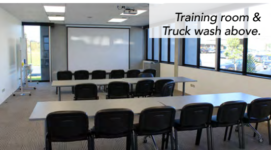
Training room & Truck wash above.