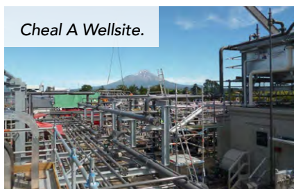
Cheal A Wellsite.