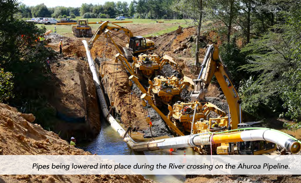
Pipes being lowered into place during the River crossing on the Ahuroa Pipeline.