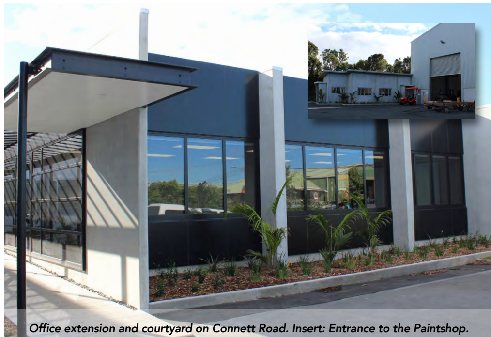
Office extension and courtyard on Connett Road. Insert: Entrance to the Paintshop.

January saw the opening of Energyworks new paint facility alongside our Bell Block workshop. The new shop includes: